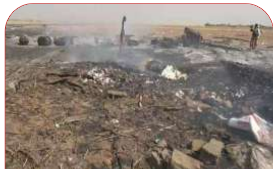
The public road and the destruction caused by Saudi warplanes

"I and some of my friends were near the main road in Al-Khamis area , Al-Zahra district. Suddenly, at about 8:30 am, the Saudi coalition warplanes launched an air strike targeting a bus carrying passengers on the main road.