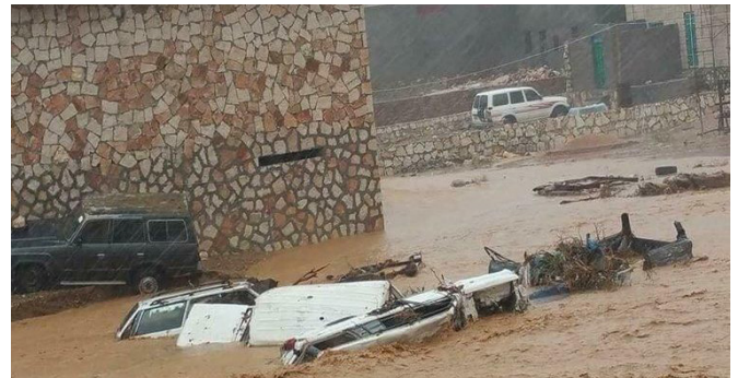
Flooding in Socotra during Cyclone Mekunu.

In order to respond to the needs created by the impact of cyclone “Mekunu” humanitarian partners are dispatching a consignment of emergency supplies to Hadibo including 10.5 Mt of food supplies, emergency medical supplies, 1,000 shelter/NFI kits, 4,000 hygiene kits, 35 water bladders and supplies of chlorine to purify water. A UN team is scheduled to fly to Socotra on 29 May to work with the local authorities in further assessing needs and coordinating response efforts. OCHA Flash Update on cyclone “Mekunu” can be found here: https://reliefweb.int/report/yemen/yemen-cyclone-mekunu-flash-update-2-27-may-2018