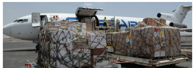
WHO supplies.

Sana’a: Four civilians were reportedly killed and nine others injured by airstrikes that struck the Yemen Petroleum Company’s main petrol station in Sana’a City, on 26 May. Women and children are understood to have been among the casualties. In Marib governorate, the health office confirmed that five civilians were killed and 22 others sustained injuries in an explosion at a local market in the densely populated Al Mujama’a area in Marib City on 22 May. Meanwhile, two WHO-chartered planes carrying over 21 MT of essential medicines arrived in Sana’a airport during the reporting period. The supplies include trauma kits for 3,200 patients requiring surgical care, medicines to treat some non-communicable diseases and cholera. A UNICEF plane delivered life-saving vaccines for over six million children.