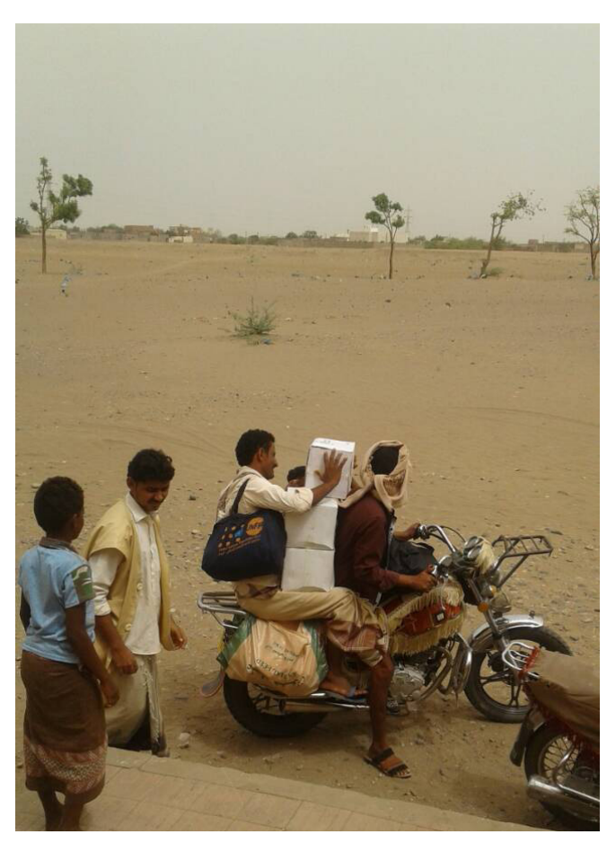
IDPs return home after receiving rapid response transit kits in Al Hudaydah.

Fighting continues in Al Hudaydah City, albeit at a less severe scale, as a general decrease in clashes, bombardments and airstrikes has been reported. Casualties are reported but actual numbers are unknown. During the last two days, large scale displacement from Al Hudaydah City has been observed, civilians are using their own vehicles or renting public transportation to move out of the city towards neighboring districts east and northwards. Humanitarian partners report that some IDPs from Al Hudaydah City have arrived in the capital, Sana'a. Total figures on displacement are not available yet as humanitarian organisations are working on verifying the IDPs.