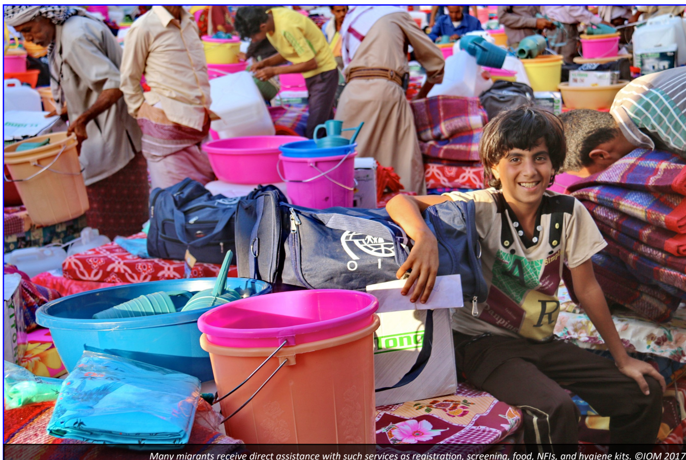
Many migrants receive direct assistance with such services as registration, screening, food, NFIs, and hygiene kits.