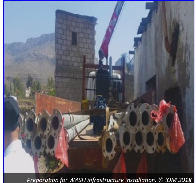
Preparation for WASH infrastructure installation.

IOM provides emergency WASH assistance to the most vulnerable, and restores and maintains water and sanitation systems towards the improvement of public health. This is achieved by provision of rehabilitation and maintenance of water supply systems, capacity building of WASH stakeholders, water trucking to IDPs, and hygiene promotion activities. During the reporting week, installations of electric submersible and horizontal pump units were completed in An-Nadirah city in Ibb, expected to benefit over 14,000 individuals . 344,000 liters of water was trucked to different water points, hospitals, and other locations in Lahj, Al-Dhale'e, Abyen, Taizz and Shabwah Governorates, benefitting over 22,000 individuals .