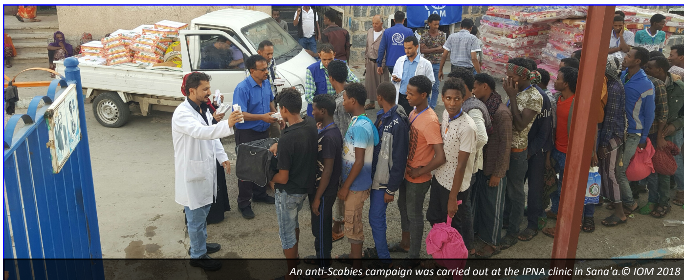
An anti-Scabies campaign was carried out at the IPNA clinic in Sana'a.

Focused psychosocial support services (PSS) was provided to 240 children and their parents—including 64 girls, 157 boys, 17 women, and 2 men—through individual and group sessions conducted in Child Friendly Spaces (CFSs).