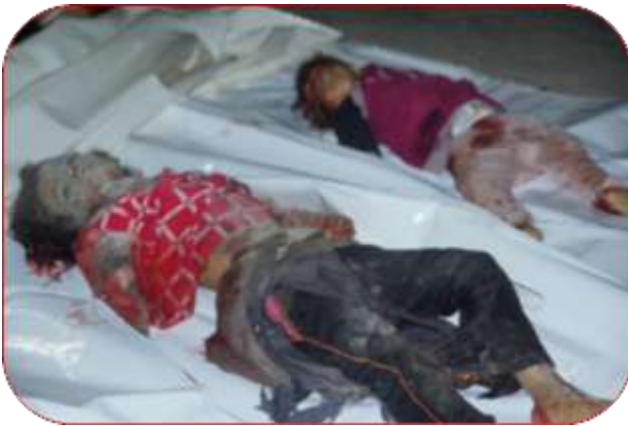
Photos of the killed victims