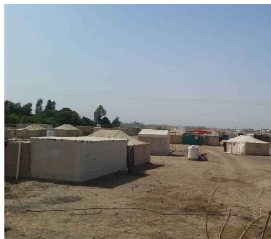
Dhamar IDP hosting site in Marib City.