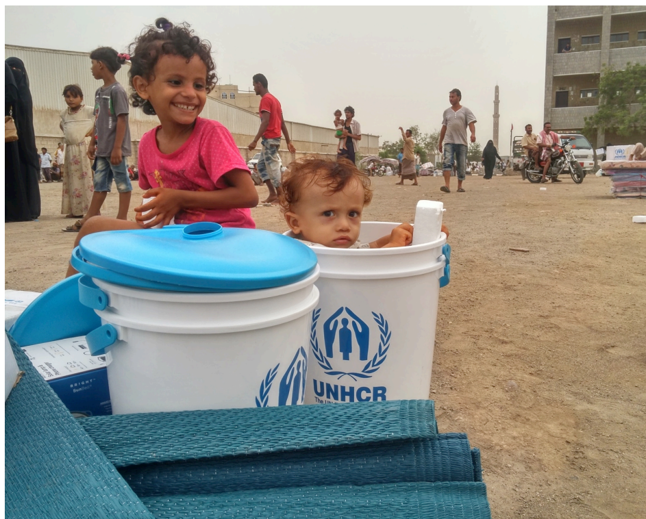
As UNHCR's partner carries out distributions of core relief items in Hudaydah city, two displaced Yemeni children find some enjoyment after being forced to flee their homes.

While displacement of families is ongoing, UNHCR and its partners are working together to reach a verifiable figure of displacement. The protection of civilians is being increasingly threatened in Al Hudaydah by indiscriminate attacks by the warring factions. According to the latest UNHCR-led Protection Cluster Civilian Impact Monitoring Report, almost 50 per cent of civilian casualties in Al Hudaydah to date have occurred when people were in their own homes or farms, and 25 per cent when they were on the road, many of them trying to access services or find routes to safety. The six-month report also highlighted that a total of 844 incidents caused over 1,800 civilian casualties, 26 per cent of which were women and children. Furthermore, 85 per cent of the incidents resulted in psychosocial trauma implications for the people affected. UNHCR continues to remind all parties to the conflict to ensure the protection of civilians and guarantee their access to humanitarian assistance.