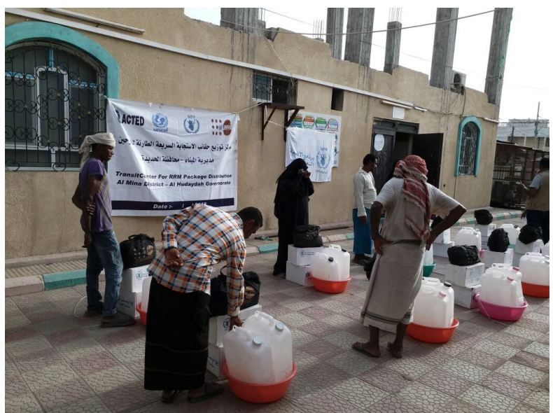
Distribution point.

As of 18 September, 76,512 households have been displaced by the conflict in Al Hudaydah Governorate since June, both within the governorate as well as in neighbouring Hajjah, Raymah and Mahweet governorates. More than 81,000 displaced households in