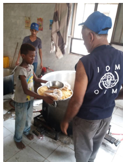
Food distribution in Al Marawa'iah.

Humanitarian organisations continue to call for all ports and access routes, including the main Sana'a-Al Hudaydah road, to remain open and safe for humanitarian operations and the flow of goods.