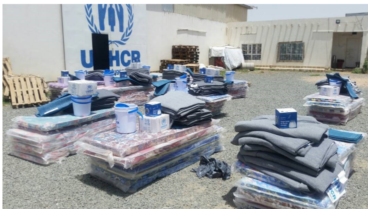
NFIs for displaced people from Hudaydah in Sa'ada.

Authorities in Sana'a report that there are 24,918 HHs originating from Al Hudaydah Governorate that are currently staying in Sana'a City. Thirty-four HHs (approx. 240 people) are currently hosted in public schools in the capital.