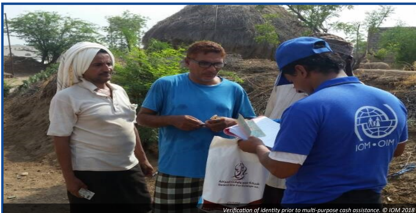
Verification of identity prior to multi-purpose cash assistance.