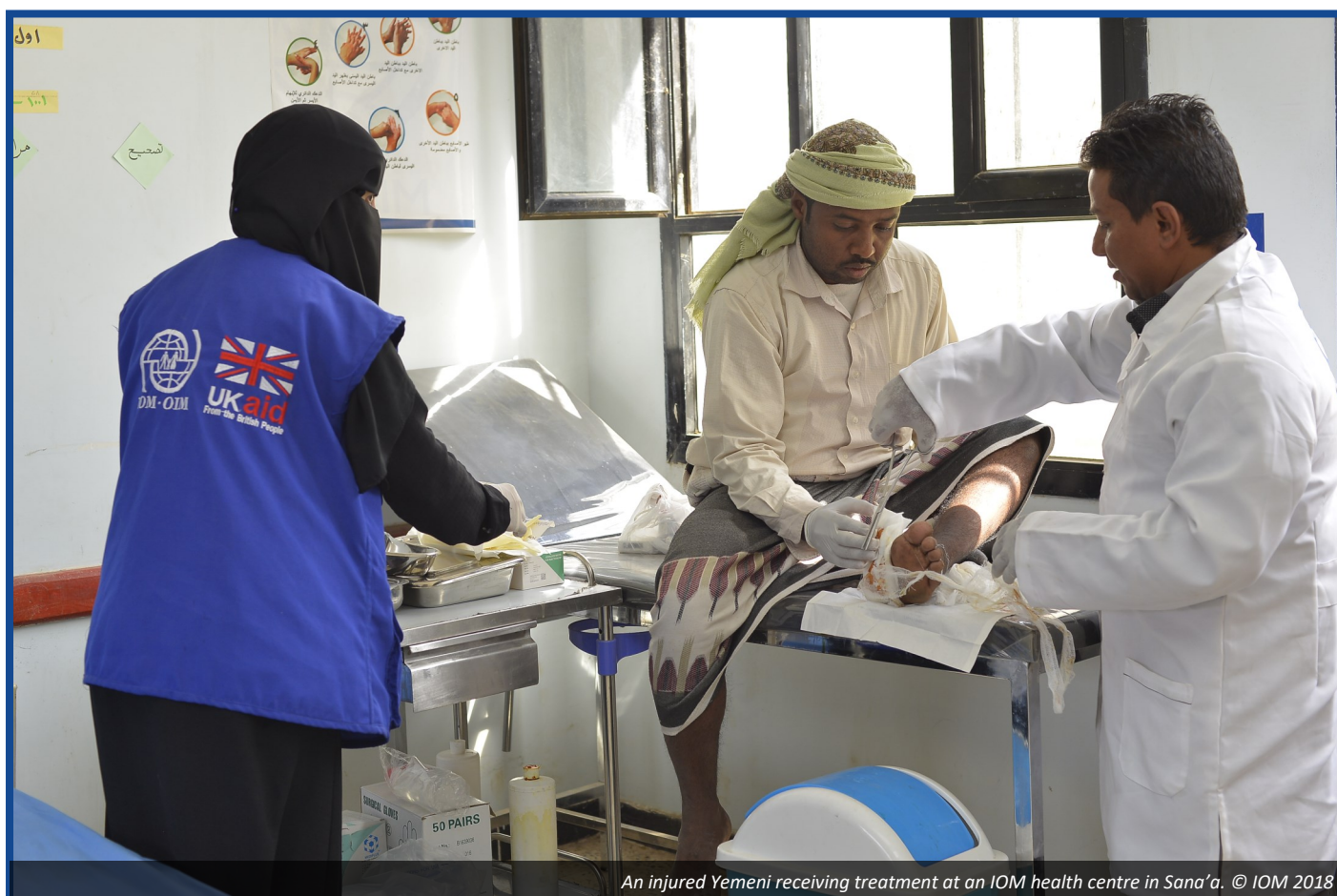
An injured Yemeni receiving treatment at an IOM health centre in Sana'a.