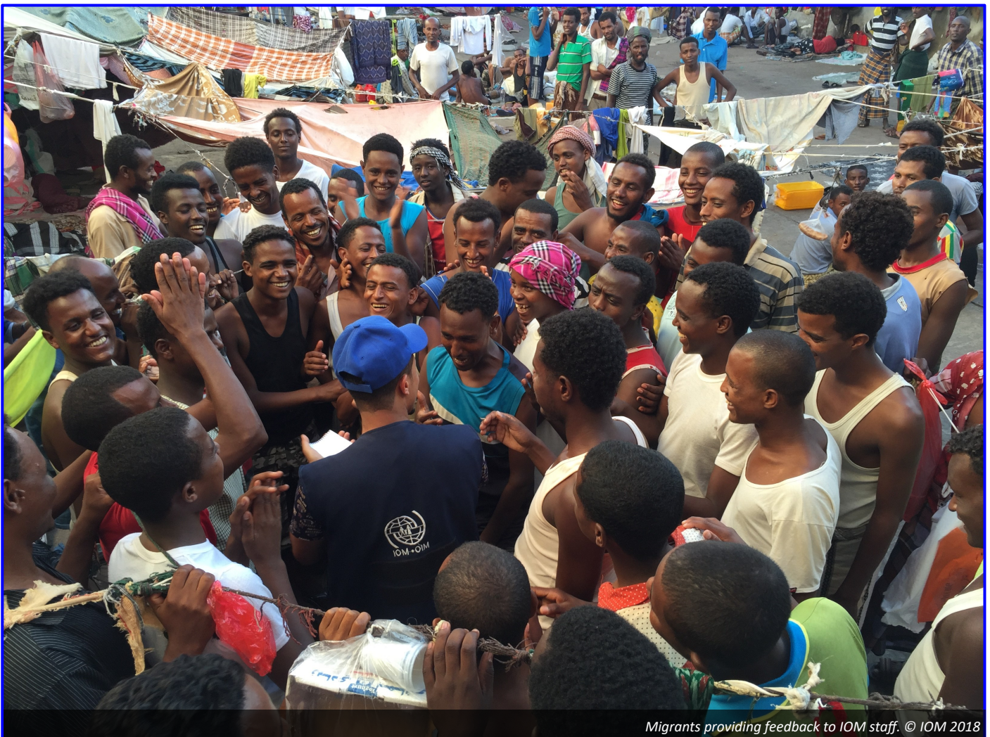
Migrants providing feedback to IOM staff.