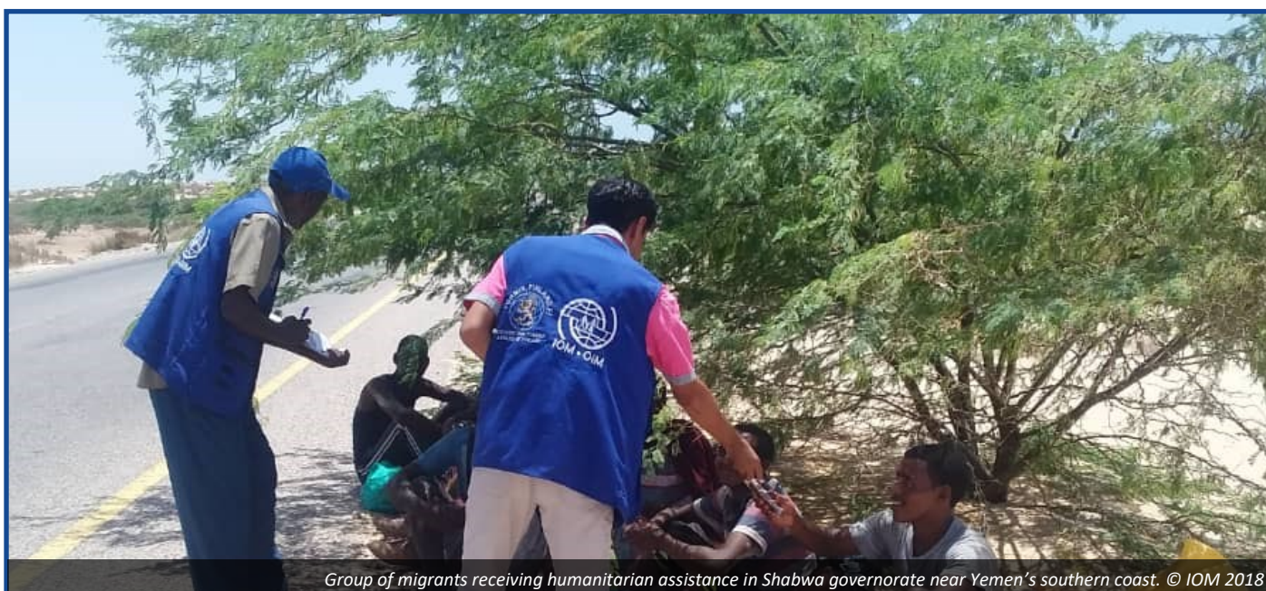
Group of migrants receiving humanitarian assistance in Shabwa governorate near Yemen's southern coast.