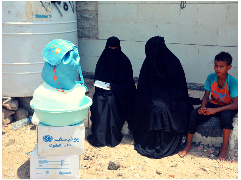
Displaced women from Hodeidah receive RRM kits after arriving in Aden