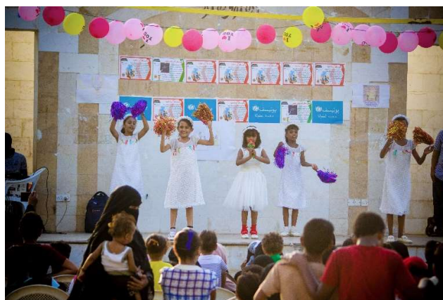
Girls sing in a back to school event held in Aden

The new school year has officially started in September, however the issue of non-payment of teachers' salaries in 12 northern governorates remains unresolved despite humanitarian partners' efforts to raise funds and address the matter by providing incentives to concerned school staff. In southern governorates, teacher strikes have been taking place in 80 per cent of schools. The strikes are caused by teachers requesting a salary increment. If the situation is not resolved soon, 3.7 million students will be at risk of missing months of education. UNICEF remains committed to find a solution and is working closely with partners to keep the education system from collapsing. At present, UNICEF is advocating with all parties to find a temporary solution and continues discussions with donors to support the payment of incentives to teachers.