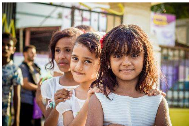
Girls participate in a back to school event held in Aden