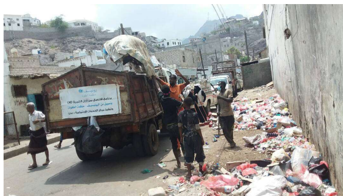
C4D community volunteers support a hygiene promotion campaign by cleaning up streets in the Al-Sharkyah neighbourhood of Aden, a high-risk cholera area.

The communication activities included 98,785 home visits, 13,662 group discussions, 4,000 counselling sessions, 4,477 community meetings and events, 49 drama shows, as well as awareness activities in 752 mosques, 87 Diarrhea Treatment Centres /Oral Rehydration Centers and 1,500 IDPs and Muhamasheen gatherings.