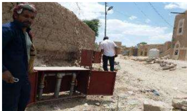
Completion of Water Supply project in Tolomos, Saada

The emergency WASH response continued to be a priority through provision of services in locations with high risks of Acute Watery Diarrhea (AWD)/suspected cholera and malnutrition throughout the month of September. Nearly 3.5 million people (including 1.75 million children) in Amanat Al Asimah, Al Hudaydah, Amran, Al Bayda, Dhamar, Marib, Ibb, Hadramaut, Taiz and Saada, were reached with provision of safe drinking water. The interventions supported the water supply systems through provision of fuel, electricity, spare parts, disinfectants for water treatment/purification and rehabilitation of water infrastructure.