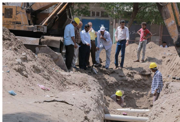
WASH teams conducting construction works as part of the rehabilitation of WASH infrastructure

The rapid depreciation of the YER continues to significantly impact significant access to WASH services. UNICEF and partners continue to try and fill the gap of fuel for water and sanitation infrastructure, as local services providers are struggling to afford the increased prices of fuel. Additionally, WASH partners are stepping in to support sold waste trucks and operating trucks to support safe sanitation disposal. A total of 65 WASH partners are active in the WASH Cluster and