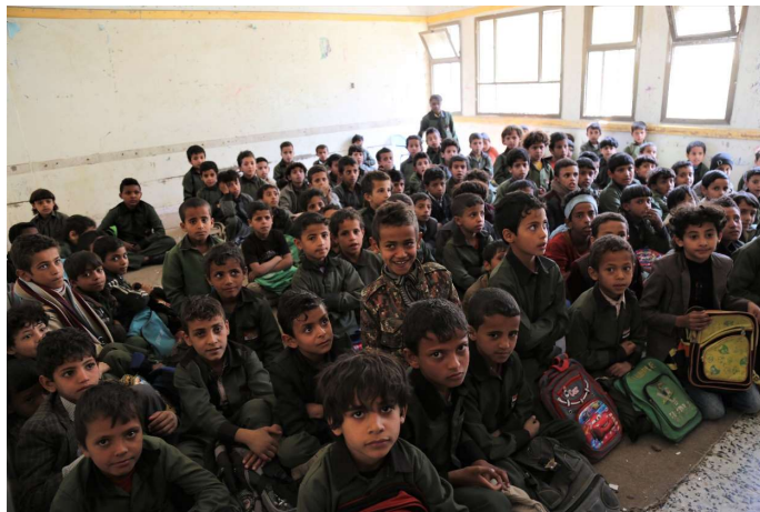
Photo taken in Al-Frusiah school, Sana'a. There are 6,000 students for 60 teachers, who have not been paid for two years and who cannot meet their basic needs.

UNICEF continues to make all efforts to prevent the education system from collapsing, particularly through providing incentives to the teachers who have not received salaries since October 2016. Further, through establishing temporary learning spaces and rehabilitating schools, UNICEF works to improve access to and quality of education. Establishing a safe learning environment plays an important role in prevention of school drop-out and increasing retention improve quality of education, including quality of learning environment.