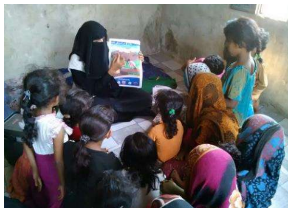
A community volunteer in Socotra following Cyclone Luban conducts awareness raising on hygiene practices

These activities were conducted by 7,000 community mobilizers including 2,000 religious leaders (1,470 Imams and 530 Morshydats, female religious leaders). The communication included interpersonal engagement through home visits to 150,000 households, 20,000 group discussions, 7,000 counselling sessions, 6,000 community meetings and events, 63 community drama shows, as well as Friday speeches in 900 mosques.