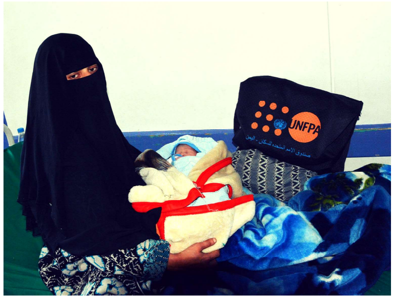
A postpartum mother with her UNFPA mama kit in Sana'a