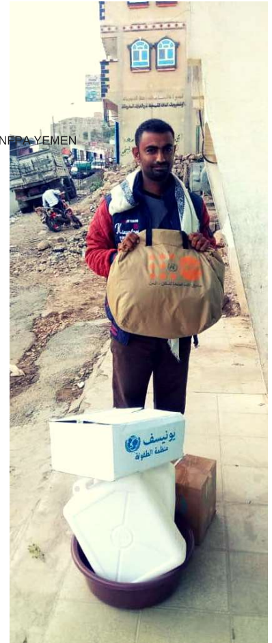
RRM warehouse in Hajjah. Distribution in Al Mahawit among displaced families from Hodeidah.