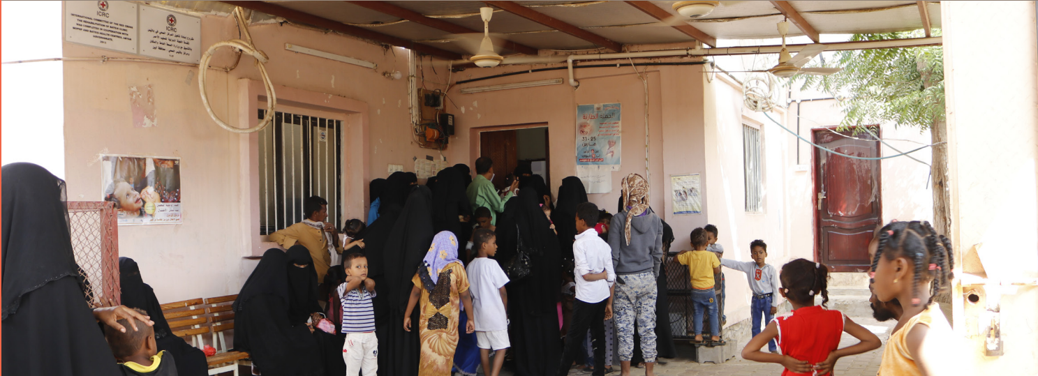
Patients wait for their turn at the ICRC-supported Bateis primary healthcare center in Abyan governorate.

In September and October, the International Committee of the Red Cross (ICRC) gradually resumed its regular pace of activities across Yemen: relief work but also support to healthcare facilities and water corporations. The situation in the country is desperate and we are advocating for a political solution to put an end to the immense humanitarian suffering and allow aid to reach all those in need.