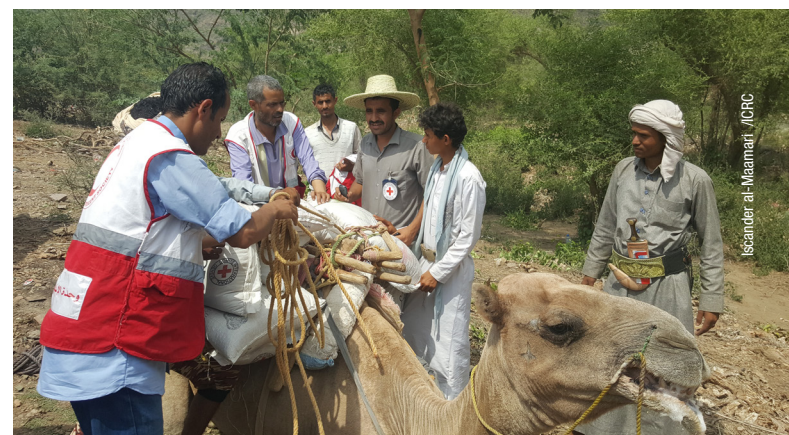
Food parcels being loaded on a camel in Mahweet.

other round of 50,000 kilograms of fodder, and 9,300kg of concentrate for its 240 dairy cows.