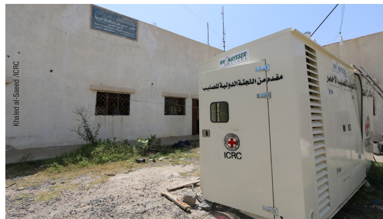
A generator donated to the Water Corporation in Taiz .

of garbage collection containers and repair of garbage collection trucks is still ongoing. Furthermore, the ICRC installed submersible pumps to increase water production supporting inhabitants and newly arrived IDPs 73,000 beneficiaries.