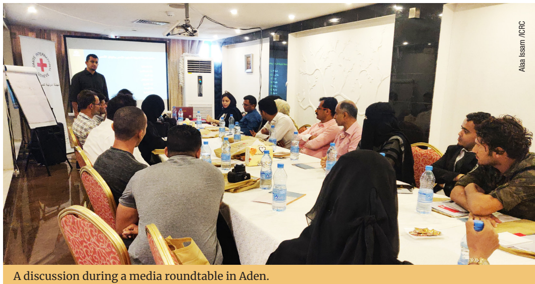
A discussion during a media roundtable in Aden.

To highlight the massive humanitarian needs in Yemen and to promote International humanitarian law, the ICRC's communication/ prevention department implemented the following activities: