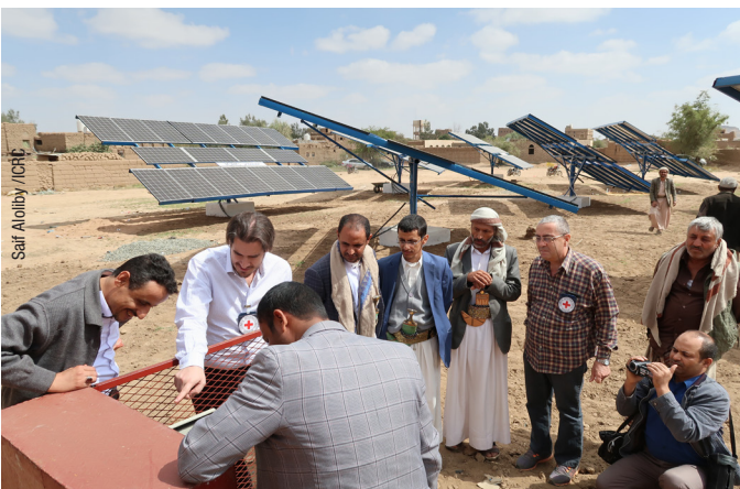
Solar panels being installed in Sa'ada.

In September and October, the International Committee of the Red Cross (ICRC) gradually resumed its regular pace of activities across Yemen: relief work but also support to healthcare facilities and water corporations. The situation in the country is desperate and we are advocating for a political solution to put an end to the immense humanitarian suffering and allow aid to reach all those in need.