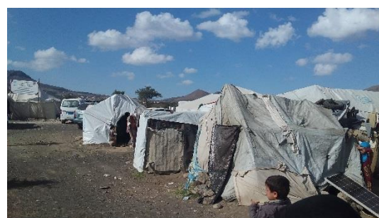
Situation of Dharwan IDP hosting sites, Sana'a.

NFI distribution completed by UNHCR through ADRA for 695 families in Dhamar and Amanat Al Asimah governorates and through YRCS (Yemen Red Crescent Society), 50 IDP and host community families were assisted in Dhi Bin, Iyal Surayh, Jabal Iyal Yazid, Amran City and Thula districts of Amran governorate. Distribution of winterization items (heavy jackets) were completed by Thoughts and Steps Organization for 109 families in Amant Al Asimah with contribution from the local community. YRCS also distributed EESKs to 33 IDP and host community families in Amran district. Transfer of cash assistance for rental subsidies completed by Marafea Al Yemen Foundation for 11 families in Bani Al Harith district in Amant Al Asimah, AOBWC (Al-Aman Organization for Blind Women Care) assisted 9 families in Amant Al Asimah with donation from community individuals.