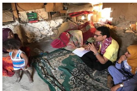
IDP woman being assessed by the Shelter/NFI/CCCM Cluster and WASH Cluster in one of the sites in Ibb governorate.

NFIs distribution completed by NRC for 258 families/1,166 individuals (282 men, 302 women, 294 boys and 288 girls) in Ash Shamayatayn district and 467 families/2,204 individuals (507 men, 543 women, 636 boys and 518 girls) in Al Mawasit district. The families assisted were displaced from Al Hudaydah between June and August 2018 and currently living with host families. Transfer of the cash assistance for rental subsidies completed by UNHCR through YWU (Yemen Women Union) for 1,503 IDP and host community families in Ibb governorate. Families assisted were already living in rented houses but they were unable to pay their accumulated rent payments due to their dire economic situation impacted by the limited livelihood opportunities and increased prices of basic commodities. Yaman organization also completed the transfer of the cash assistance for 200 families and targeted mainly vulnerable families with chronicle illnesses.