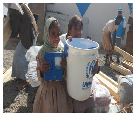
IDP children feeling happy while carrying Non-Food Items provided to their families.

NFI distribution completed by UNHCR through YDF (Yemen Development Foundation) for 1,974 families in Razih district and 133 families assisted with NFIs and EESKs in Sa'adah City. Most of the families assisted were displaced from Al Hudaydah and Hajjah governorates. Transfer of cash assistance for rental subsidies started in Al Jawf targeting 2,554 families out of which a total number of 1,258 families receiving first payment while 1,296 families are receiving the second payment as they have received the first payment few months ago.