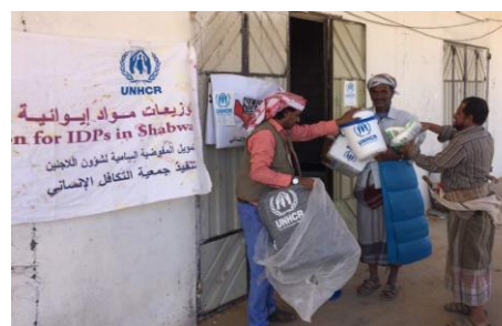
IDPs receiving essential NFIs delivered by SHS in Bayhan district, Shabwah governorate.

NFI distribution completed by UNHCR through SHS for 102 families in Bayhan district (Shabwah), 216 families in Al Mukalla district (Hadramaut) and 230 families in Sayun district and 43 families in Ghayl Ba Wazir district. SHS also assisted 500 families affected by Luban Cyclone in Al Ghaydah, Qishn, Huswain, Al Masilah and Sayhut districts in Al Maharah governorate. UNHCR through SHS, HYAC, and NRC distributed EESKs to 112 families in Khaled Ibn Al Waleed Collective Center in Dar Sa'd district (Aden), 48 families in Al Sha'b IDP hosting site in Al Buraieqeh district (Aden), 170 families in Saber IDP hosting site while NFI distributions targeted 456 families in Tuban district (Lahj) and 305 families in Khanfir district and 122 families in Zingibar district (Abyan). Another distribution of NFIs completed through NMO (Nahdah Makers Organization) for 2,996 families in different locations including IDP hosting sites such as Al Yabili, Al Gashah, Bani Jaber, Al Aqed, Al Mazare'a in Al Khawkhah district (AlHudaydah). NMO started the distribution of NFIs for 336 families in Qa'atabah districts (Al-Dhala'a). Transfer of the cash assistance for rental subsidies completed by UNHCR through Al Amal Bank for 533 families: 122 in Aden, 4 in Al Hudaydah, 88 in Hadramaut, 174 in Lahj and 145 in Taizz.