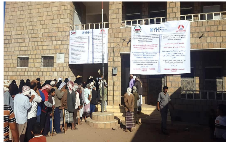
Figure 1: beneficiaries are lining up to get their vouchers in Alasabeh sub-district.

20 members (10 males, 10 females) of our FSL distribution team have been trained on the protection aspects, code of conduct, and the distribution process of cash assistance transfer. The workshop mainly intended to train and strengthen the distribution team skills and ensure their readiness to go to the field and manage the distribution of cash assistance transfer expeditiously.