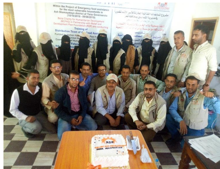
Figure 2: Training the team on the protection aspects, code of conduct, and the distribution process of cash assistance transfer.