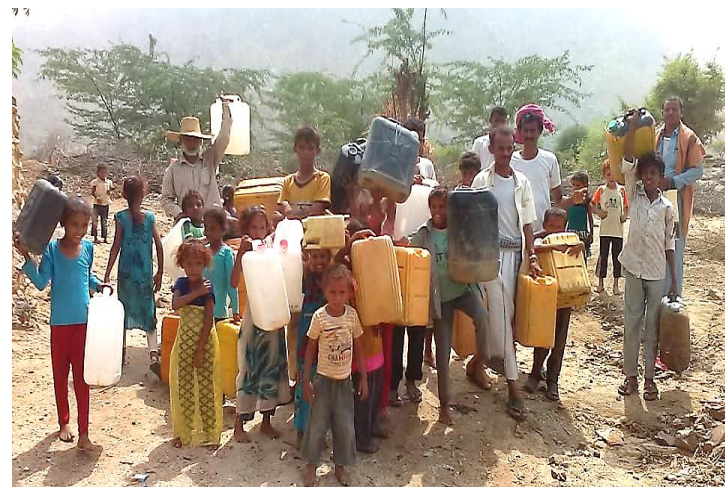
Figure 3: Massive number of people are in acute need of WASH interventions in Khayran Al Muharraq Dist of Hajjah Governorate.