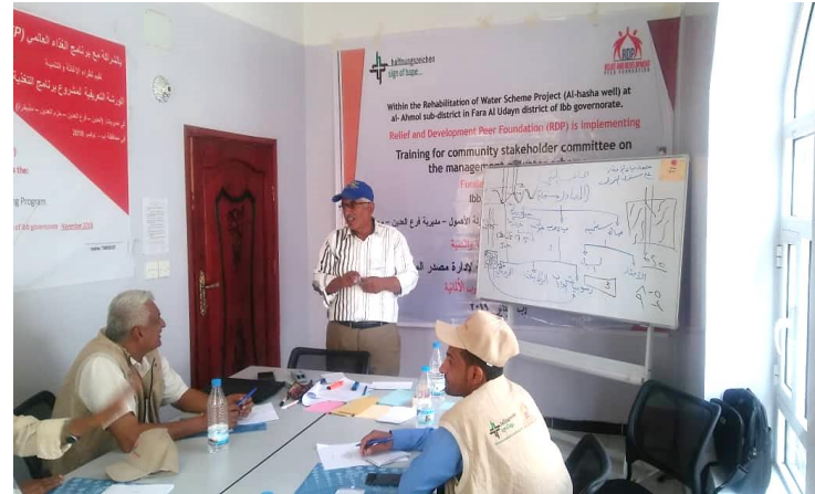
Figure 2: Training community stakeholder committee on the management of rural drinking water based on the latest administrative approach.

During the reporting period, RDP has conducted a comprehensive WASH Needs Assessment through 62 sub-districts of Wusab Al-Aali district, 15 sub-districts of Al-Qafr district, and 5 sub-districts of Khayran Al Muharraq district to measure the humanitarian situation and vulnerability levels, planning and prioritizing the needs and adopting the appropriate and suitable methodology of intervention in the districts.