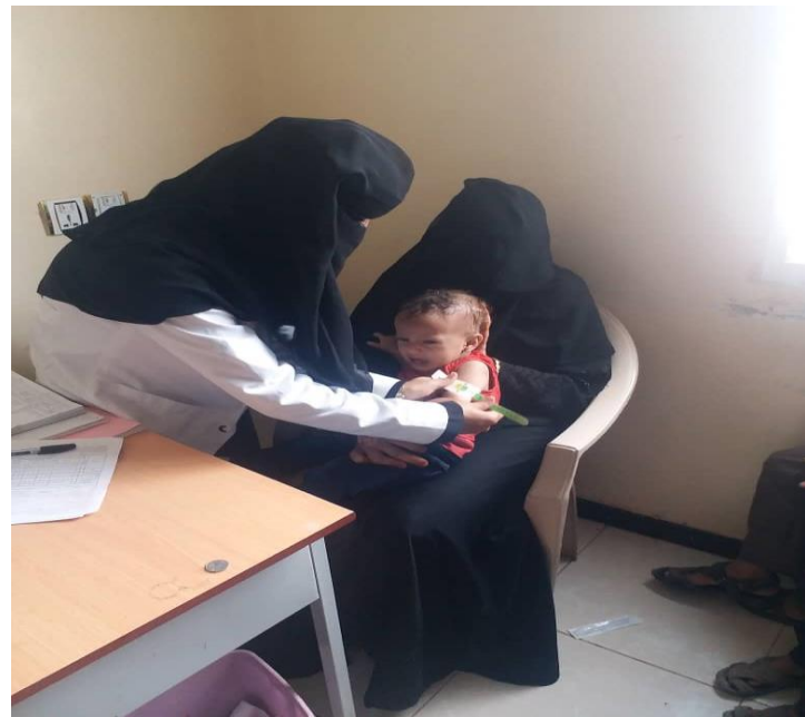
Figure 2: Through supported HFs, our HWs continue treating MAM cases of children under 5 and PLW over four districts.