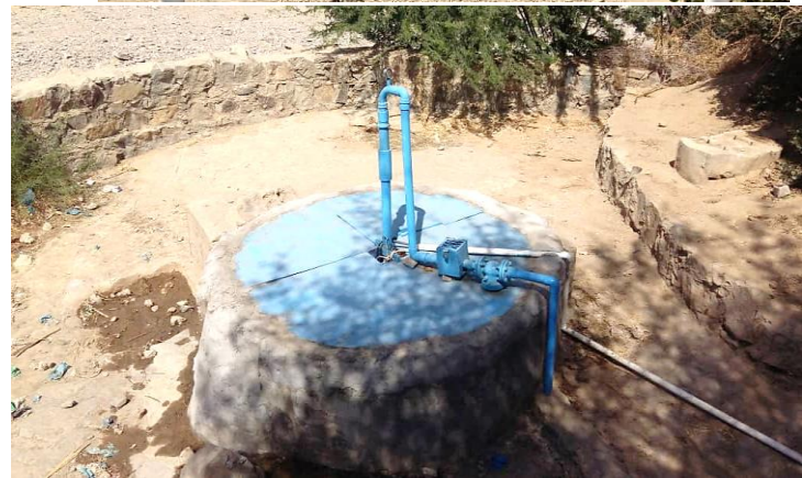
Figure 1: Rehabilitation of Al-Hasha well is successfully completed.