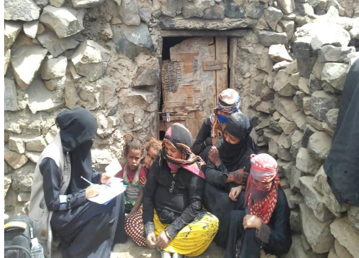
Figure 3: Registering most vulnerable households through our FSL field members in Dimnat Khadir District.

To scale up the emergency food assistance to the most affected and vulnerable HHs, RDP in partnership with WFP is implementing the project of "General Food Assistance for the most Vulnerable Households" in (Wald Rabe'e, Al Malagim, As Swadyah) districts of Al-Bayda Governorate, targeting 7,630 HHs as 3,310 HHs in Al Malagim, 2,332 HHs in As Swadyah, and 1,988 HHs in Wald Rabe'e.