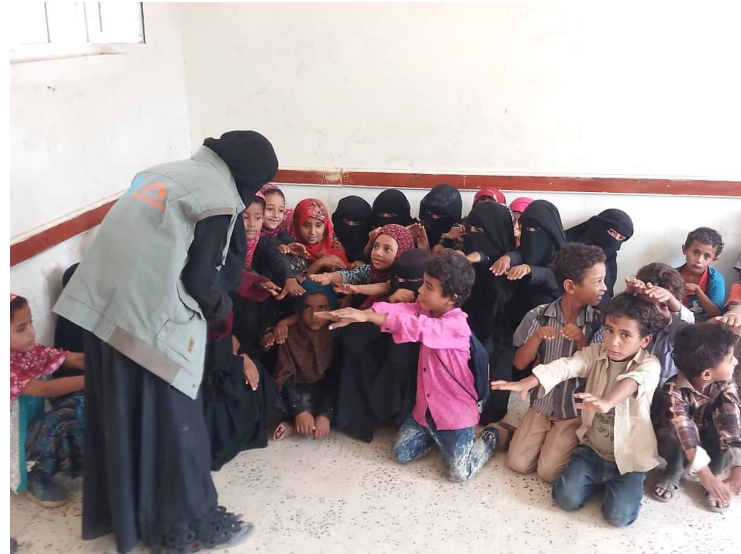
Figure 3: Increasing community awareness on hygiene and IYCF key messages through our CNVs.

Increasing community awareness and prevention capacity in order to reduce the prevalence of acute malnutrition, communicable diseases, maternal mortality and others, our 283 Community Nutrition Volunteers (CNVs) have launched over 1,076 awareness-raising campaigns for people in the second and third tiers around the supported 52 health facilities in Fara Al-Udayn, Hazm Al-Udayn, Mudhiakhera and Al-Udayn districts, achieving a total number of 17,747 individuals disaggregated (4,483 men, 13,264 women). These sessions included important health, nutrition, hygiene, and Infant Young Children Feeding (IYCF) key messages.