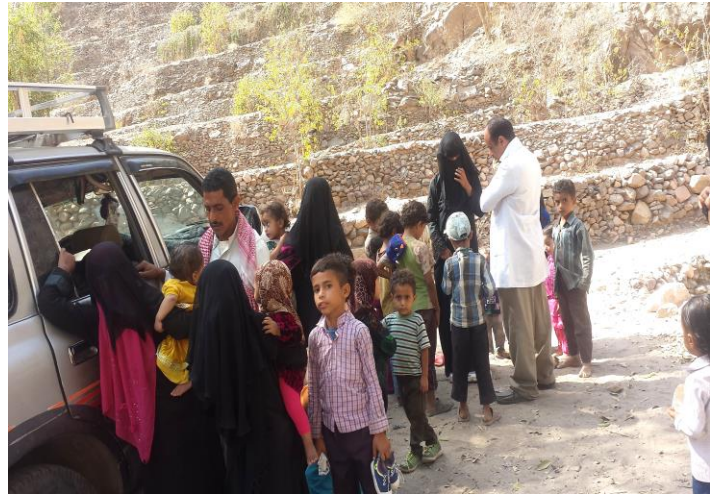
Figure 1: Serving children under 5 and PLW with TSFP services in the second and third tires through our mobile teams.

Over 2 million Children under 5 (CU5) and 1.14 million Pregnant and Lactating Women (PLW) are acutely malnourished. Hence TSFP interventions are significant to improve these statistics and to ensure the well-being of Yemeni children. RDP has been supporting 52 health facilities with TSFP services along with 8 mobile teams and 283 Community Nutrition Volunteers to serve CU5 and PLW who are suffering from moderate acute malnutrition over four districts. During the reported period, an achieved total number of 5,899 children (2,626 boys, 3,273 girls) and 747 PLW have received TSFP services. 18, 195 children (8,872 boys, 9,323 girls) and 7,577 PLW were screened for identification of malnutrition.