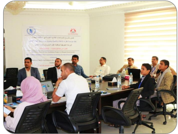
Figure 1: Holding an induction workshop for GFA project staff at Sana'a head office.

March distribution cycle of "General Food Assistance for the most Vulnerable Households" has been launched by our FSL team in (Wald Rabe'e, Al Malagim, As Swadyah) districts of Al-Bayda Governorate, targeting 7,630 HHs of 53,410 individuals disaggregated (21,364 men, 22,219 women, 4,806 boys, 5,021 girls).