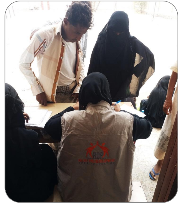
Figure 4: Checking IDPs list of names to confirm those who are not supported with relief food assistance provided through humanitarian organizations.

Our FSL team have completed the verification process for 100 HHs of IDPs in Al-Qanawis district of Al-Hudaydah Governorate to ensure that all registered households are not among those supported with relief food assistance provided through various humanitarian organizations, and they are adhered to the vulnerability selection criteria of beneficiaries.