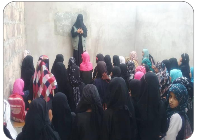
Figure 2: Raising community awareness on the importance of health and nutrition key messages.

Our 283 Community Nutrition Volunteers (CNVs) have launched over 939 awareness-raising campaigns for people in the second and third tiers around the supported 52 health facilities in Fara Al-Udayn, Hazm Al-Udayn, Mudhiakhera and Al-Udayn districts, achieving a total number of 16,491 individuals disaggregated (3,671 men, 12,820 women). These sessions included important health, nutrition, hygiene, and Infant Young Children Feeding (IYCF) key messages.