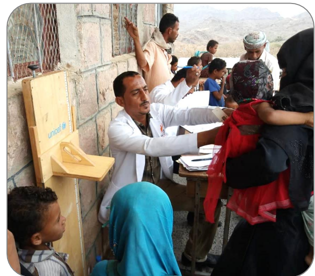
Figure 1: Serving children under 2 and pregnant & lactating women with TSFP services (Plumpy doz and Soya (WSB+) in remote areas.

RDP has been supporting 52 health facilities with TSFP services along with 8 mobile teams and 283 Community Nutrition Volunteers to serve CU5 and PLW who are suffering from moderate acute malnutrition over four districts. During the reported period, an achieved total number of 5,255 children and 1,586 PLW have received TSFP services. 17,648 children and 6,630 PLW were screened for identification of malnutrition.