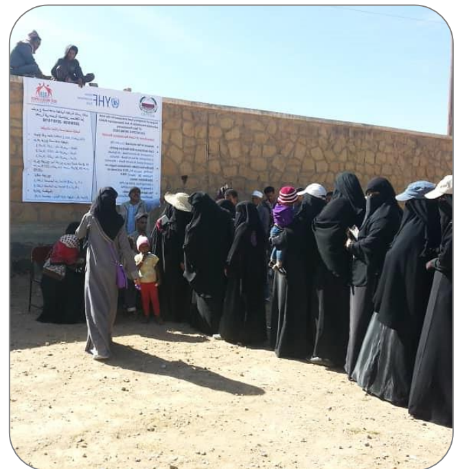
Figure 3: Vulnerable HHs are queuing for their food rations in Ash Shamayatayn district, Taizz Governorate.

According to the criteria WFP use to select food assistance committees at a district level, our three districts' supervisors have completed the formation and arranged a meeting with the 21 nominated members (7 members in each district) to clarify their roles and responsibilities towards the sub-district level.