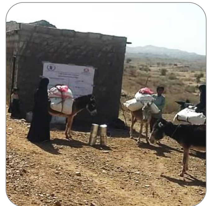
Figure 2: Benefiting neediest families in remote areas through general food assistance in Al-Bayda Governorate.