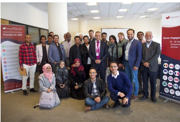
Participants of the Shelter/NFI/CCCM Cluster Donor Engagement Session in Amman, Jordan.

The Shelter/NFI/CCCM Cluster organized a Donor Engagement Session from 25 th to 26 th of March in Amman, Jordan which was attended by 30 participants from donors, UN and NGO Partners and SNCCS (Sub-National Cluster Coordinators). This was an opportunity to strengthen relationship between the Cluster and donors and review the Cluster strategy for 2019-2020. The Shelter/NFI/CCCM Cluster Coordination Team presented their work and priorities, Cluster partners highlighted challenges and lessons learned and donors presented their priorities.