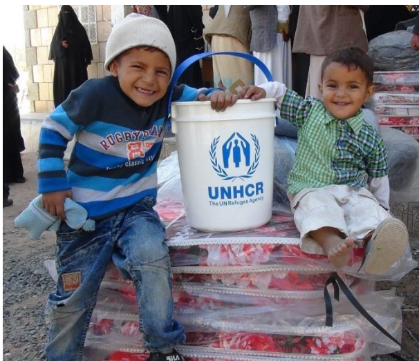
IDP children feeling happy with the Non-Food Items distributed by Khadijah Foundation for Development with stocks provided by UNHCR in Yarim district, Ibb Governorate.

SNCC (Sub-National Cluster Coordinator) went on field visits to the IDPs hosting sites in Al Dhihar and Dhi As Sufal as outcome needs and gaps were identified.