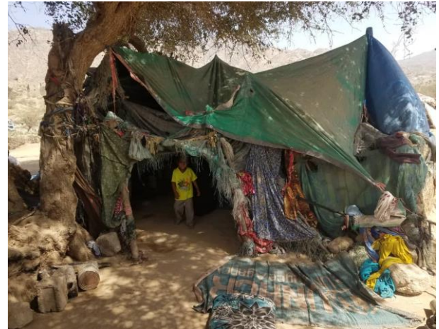
An IDP child living with his family in makeshift shelter made from worn-out plastic sheets in Khayran Al Muharraq district, Hajjah. They are among those recently displaced from Hajour area in Kushar district.

death of 22 people including 12 children and 10 women and injury of another 30.