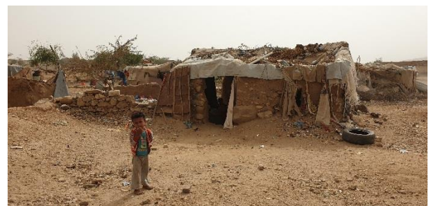
An IDP child standing in-front of his shelter which does not provide protection from the elements, adequate space to live and store belongings in IDP hosting sites in Abs district, Hajjah Governorate.

Inter-Cluster Mission participated by Cluster Coordinators and OCHA visited Hajjah from 30 th of March to appreciate the need, identify gaps and boost the implementation of response.