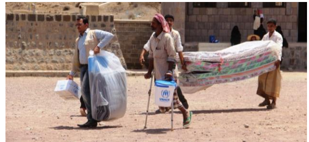
An IDP received Non-Food Items and helped to carry the items distributed by International Youth Council-Yemen and provided by UNHCR in in Al Ma'afer and Al Mawasit districts, Taizz Governorate.